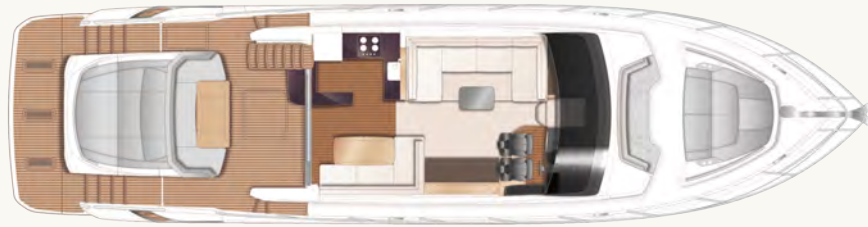
S62 Main Deck